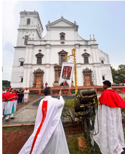
Proclaiming the beginning of Novenas

Preparation for the feast started with blessing of the banner (Maddi) and mass on 21 st May. Novenas were celebrated from 22 nd May with the somudais / wards taking responsibilities for whom the days were marked. Everyday evening the novenas started with reciting of Holy Rosary of Mother Mary.