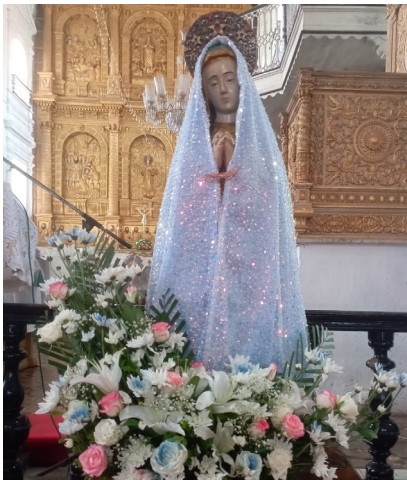
Floral Tribute to Our Glorious Lady of Three Necessities on her feast day

The feast was celebrated by the Confraria brethren of our parish.