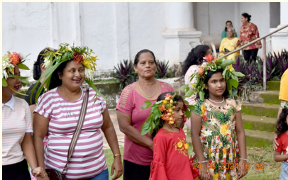
Kopel Competition Contestants

entertainment keeping in mind the tradition and season of the year. The event constituted of on-stage and off-stage activities. Individual as well as ward-wise games were organised for better participation. Activities such as Kopel-making contest, Fruit Platter Decorations, Alle-Belle and various water based games and spot prizes were held. The highlight