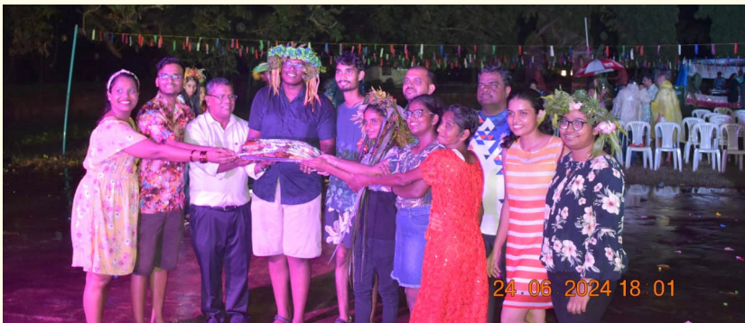
Inter-ward Champions for São João-St Catherine Somudai

entertainment keeping in mind the tradition and season of the year. The event constituted of on-stage and off-stage activities. Individual as well as ward-wise games were organised for better participation. Activities such as Kopel-making contest, Fruit Platter Decorations, Alle-Belle and various water based games and spot prizes were held. The highlight