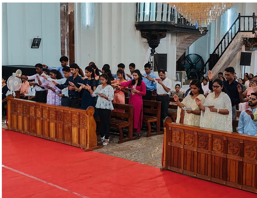
A solemn attestation of commitment and dedication.

how youth formed a very important part of the parish and that like the flower spreading beauty and fragrance of the word of God wherever they went.