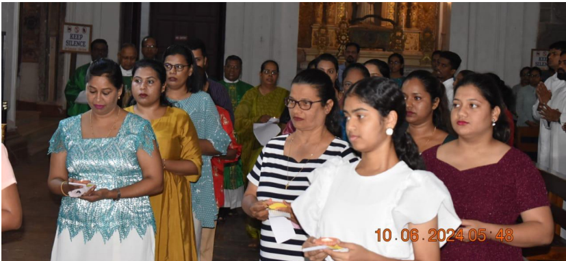
Jezuichea Ollkhichea Novea Vorsak Uggtavnechem Mis

Dhinvasnechem gayon zalea uprant, Sondexkaranim aplea hathan pettloleo pont’teo gheun Paskachea vatir hat pattoun, aplea hathant ghatlolea dotonicheam bhurgeank Jezuichea ollkhin vaddouk, ietolea poristhithink bhavarthan fuddo korun, bhurgeamcho bhavarth jivall korunk vavurtolim mhonn Jezuk apli bhass dili. Mis somplea uprant, apli diloli bhassavnni puri korun bhurgeank sangatak gheun ap-plea vorgant gelim.