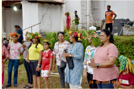
Viva São João

São João a celebration of unity and faith, the same faith that Elizabeth was filled with through the Holy Spirit, was organized by the youth group of the Se Cathedral Parish on 23 rd June 2024. The aim of the event was to come together as one family and share the friendship and brotherhood through some games and