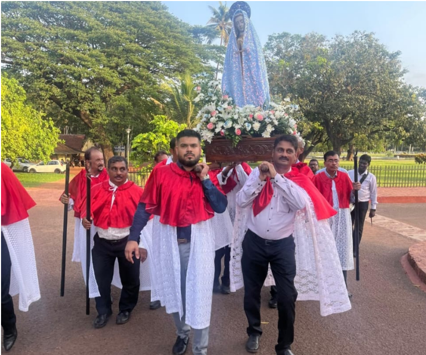
Our Lady of Three Necessities blesses us on our way.

“May Our Lady of Three Necessities Bless Us All”