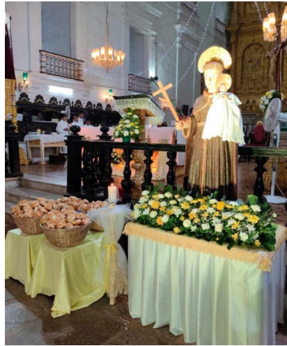
St Anthony's bread at the feast mass in honour of the saint

This Year Our newly formed "Our Lady of light "Somudai had the honour of celebrating the feast of St Anthony. Everyone pitched in generously with help coming from all directions. The main altar and a separate table for the statue of St. Anthony was decorated with lights and flowers.