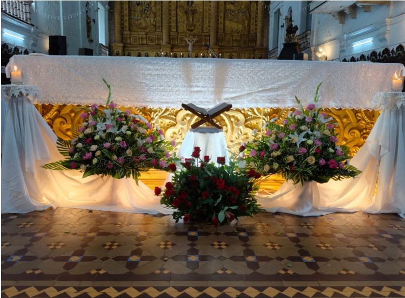
A Symbolic floral offering of growth and unity

The Youth Inaugural Mass for the Pastoral year 2024-25 took place on Sunday, June 18th, beginning at 7:30 am. The event was a significant milestone, marking the formal induction of new youth members into the Parish Youth Group. The Pastoral theme “Go Proclaim the Word of God” was also the theme for the Eucharistic celebration.